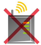
[Wireless LAN router]